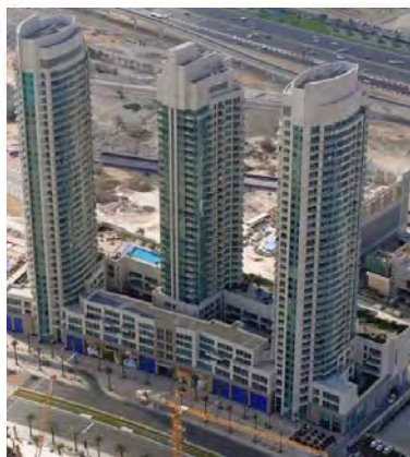
The Lofts DUBAI