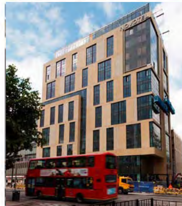
Black Friars LONDON