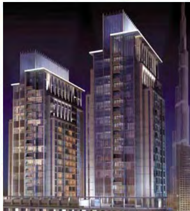
Boulevard Central DUBAI